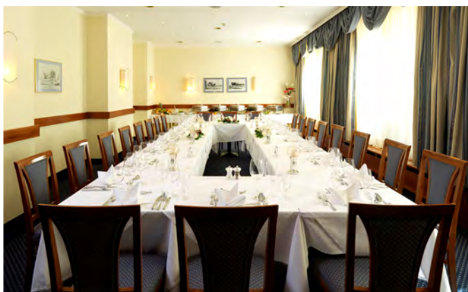
Salon 60m 2