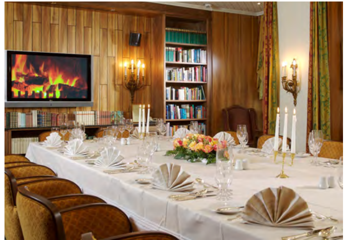
Bibliothek 45 m 2