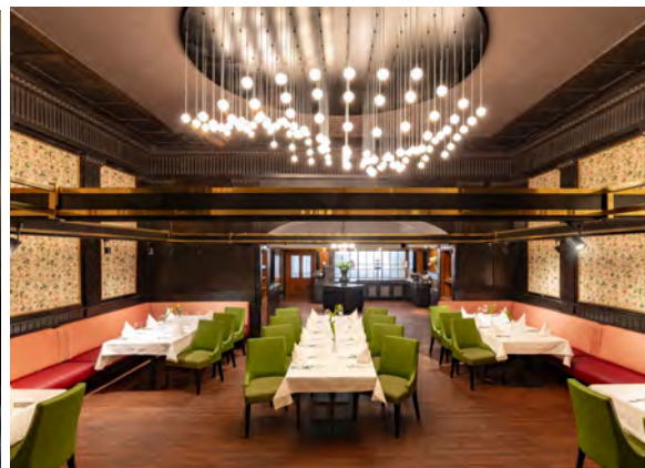
Serviette 80m 2