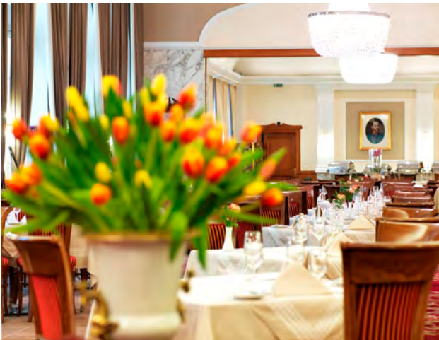
Festsaal 235 m 2 - in 3 Teile unterteilbar